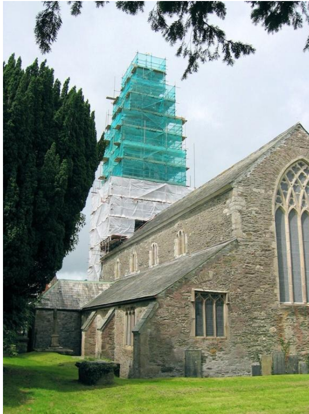
Work in progress at St Bart's