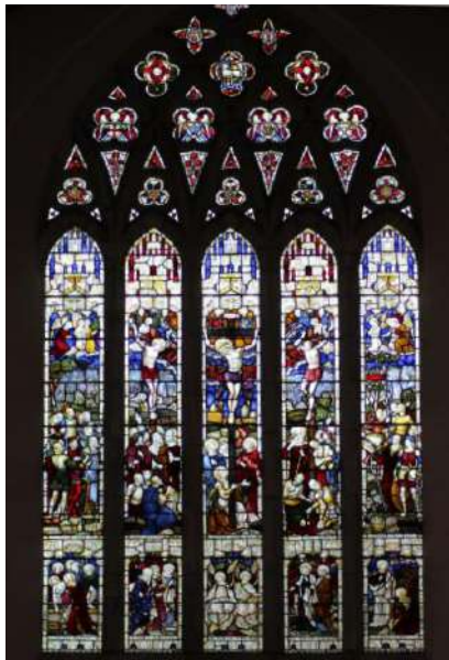
The East Window

The building has many wonderful features to cherish and maintain. Its six bells were refurbished in 2009, and a new bell frame constructed inside the tower. Behind the altar, the impressive East Window is one of the largest in any Cornish parish church.