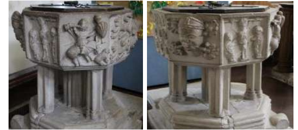
The Font, thought to be 13th century

Our main focus is fund-raising for ongoing maintenance, rather than specific projects. With the generous support of the public we strive to enhance and maintain this beautiful old church for the benefit of the present generation and for the generations still to come.