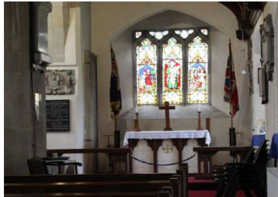
St George's Chapel

Our fund-raising efforts have successfully assisted the church with a grant for major refurbishment of the vestry. Other grants towards maintenance projects include replacement of the electrical and heating systems, repairs to the roof, tower, spire, walls, chancel, porch and St George's Chapel.