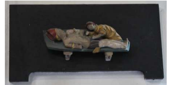
Alabaster monument depicting the martyrdom of St Bartholomew (feast day 24th August), located near the South Window