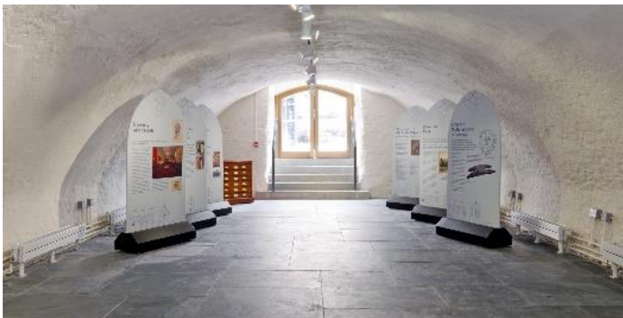
The undercroft information boards, building timeline and room labels will be made available online