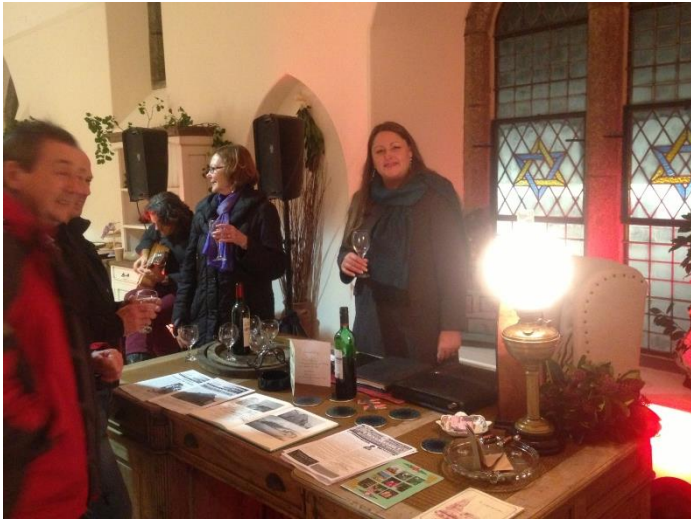
Dickensian Evening in the Main Hall