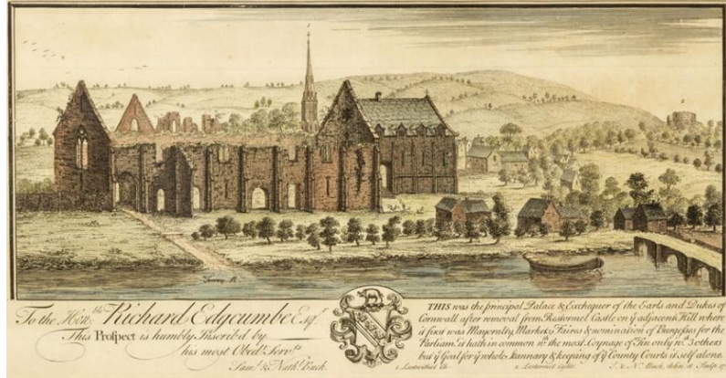
THE SOUTH-EAST VIEW OF LESTWITHIEL-PALACE, IN THE COUNTY OF CORNWALL.

Old Duchy Palace has a long and varied history. Built in 1292, as part of the headquarters of the Duchy of Cornwall, it's now the only complete building remaining from the 2-acre medieval complex that once extended along the quay. Its vaulted undercroft opens onto Fore Street, and the large hall upstairs is accessed from Quay Street. The hall had many different roles, at various times housing the Stannary Parliament, Coinage Hall, and County Assizes. After being sold by the Duchy in 1873, it was converted to a Masonic Lodge. When the Lodge closed in 2008,